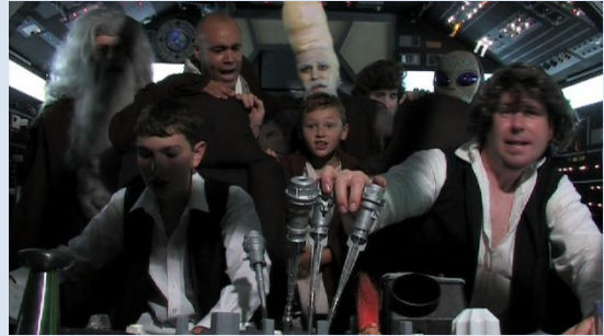
The Emperor's New Clones Screen shots