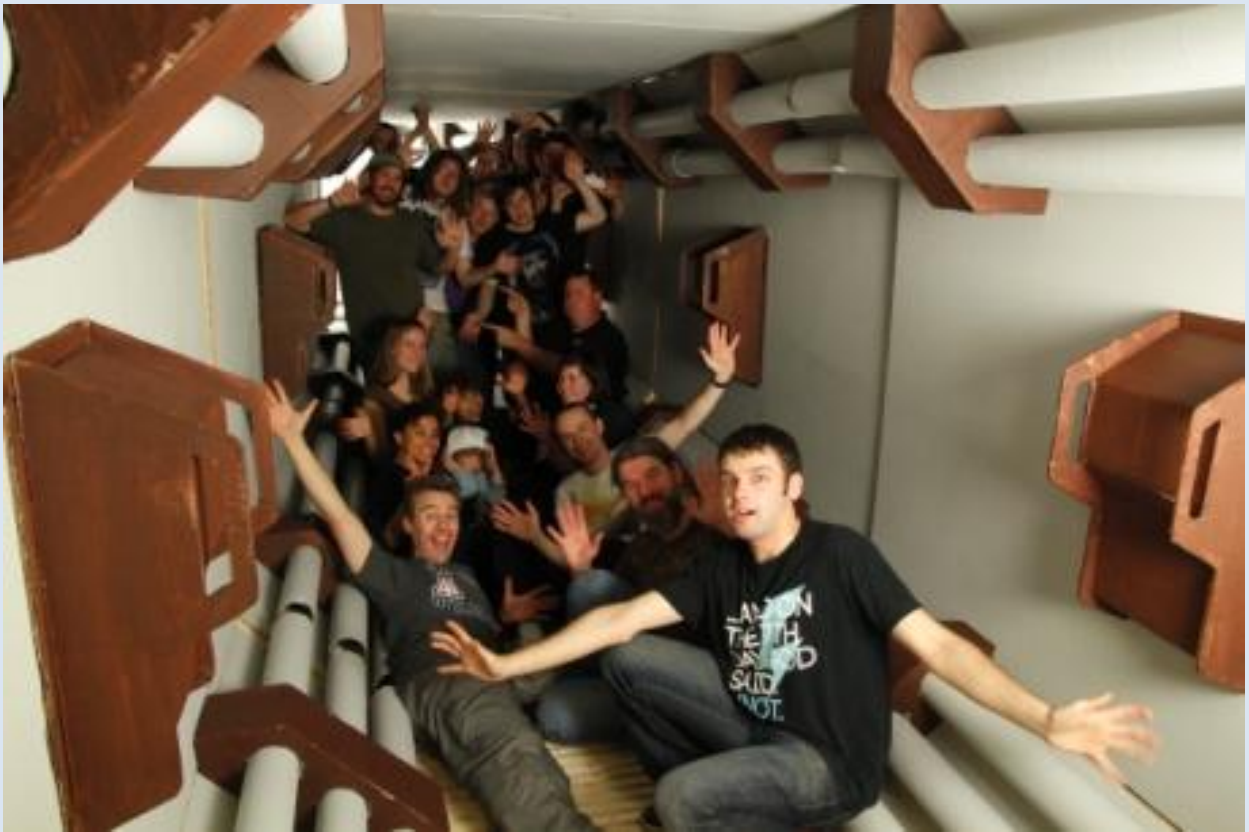
The Drift Set building crew