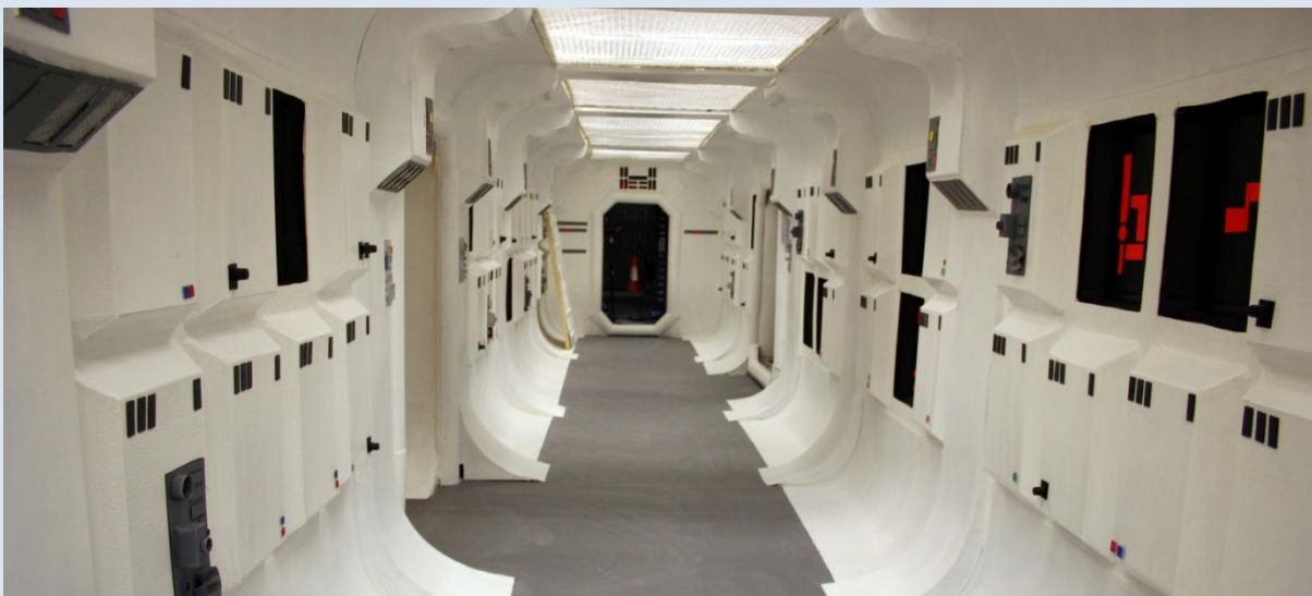
Star Wars Set built by Backyard Productions in 2005

The filmmakers are no stranger to Sci-Fi; they have already made two Star Wars Fan films as well as an Indiana Jones Spoof .