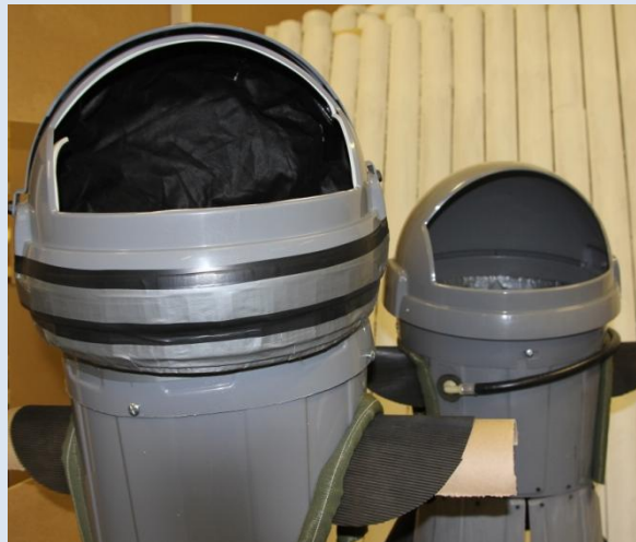
Space suit helmets (under construction)