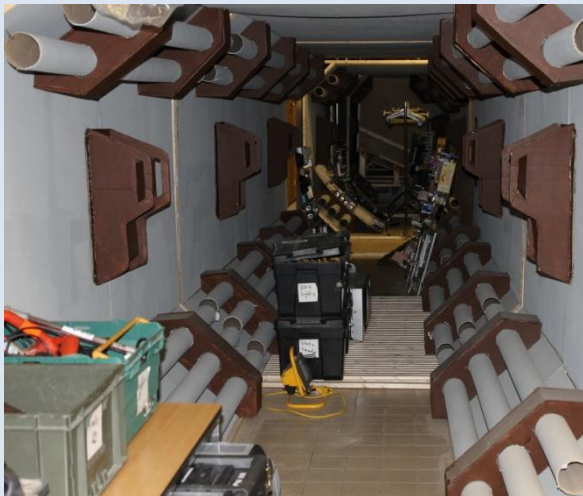
Drift Corridor set (under construction)

The filming of the production itself will take place in March 2012, although there will be activities almost every weekend leading up to the main shoot. But Darren is not too worried.. yet. "The aim is to make sure we are all ready for the big shoot. We have spent over £3000 on this project, so we want to make sure that we are well prepared!".