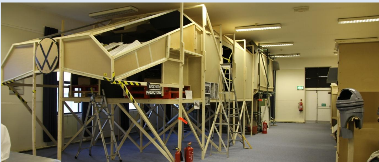
The 2-floor Deliverance set from the outside